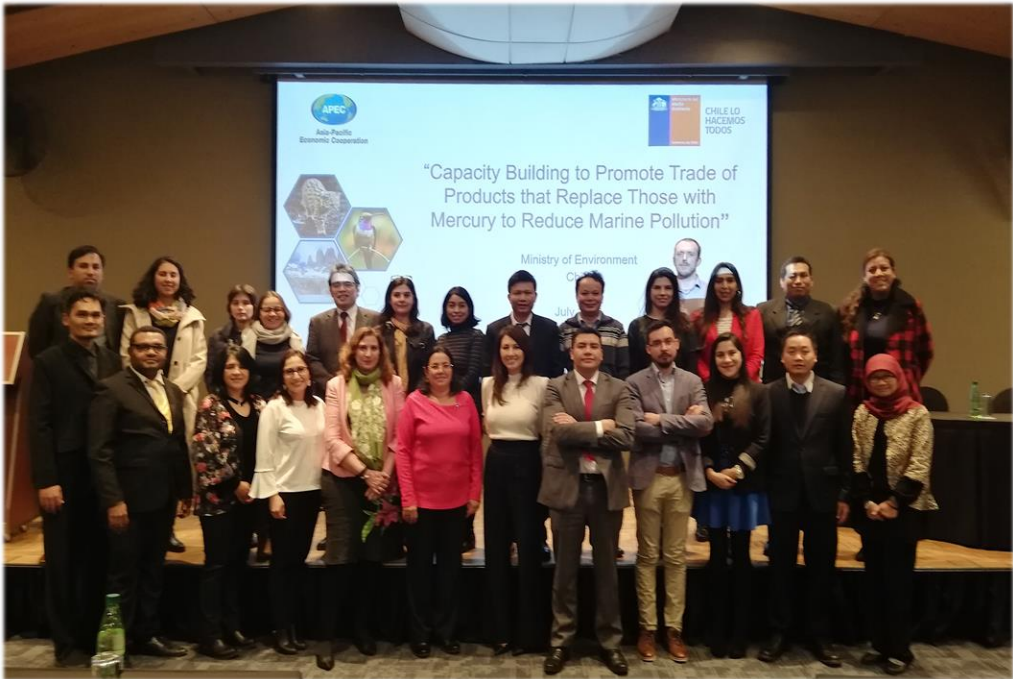
Figure 2: Workshop attendees