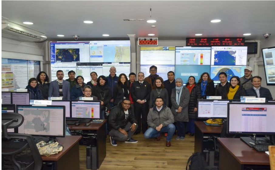
Figure 3: Field trip

Also, during this field trip, officers from the Chilean Navy explained to the delegates the collaborative activities that exist between the navies of the APEC economies to share scientific information on the ocean, prevent marine pollution and monitor the proper functioning of maritime transport, fishing and tourism.