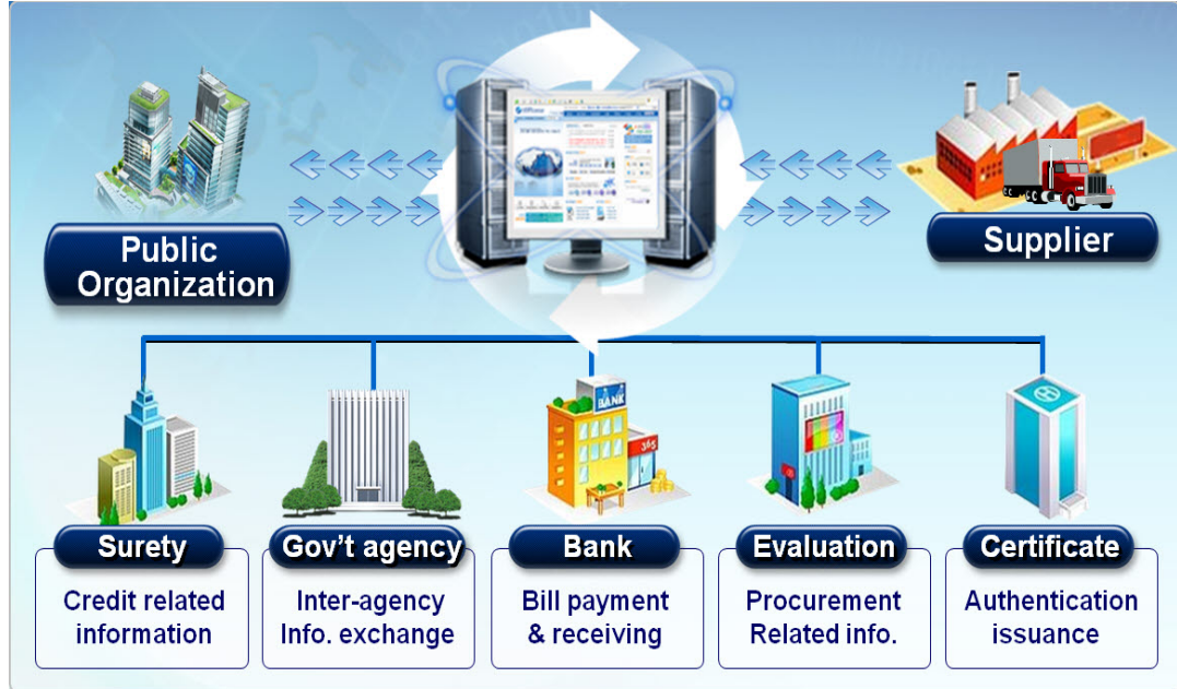
Box 1. Conceptual diagram of KONEPS's data exchange links

KONEPS comprises over 10 sub-systems, including electronic tendering system, document exchange system and other support systems for catalogue and supplier performance management. It presents several distinctive characteristics owing to its extensive architecture: