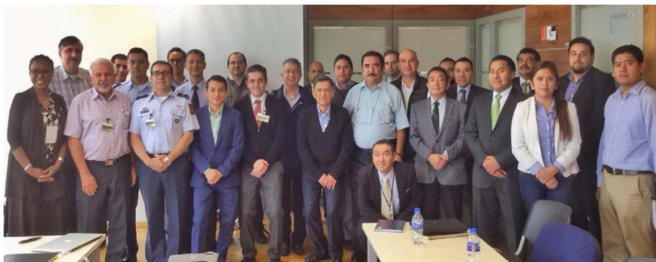
Attendees at Site Visit 1 – Mexico City