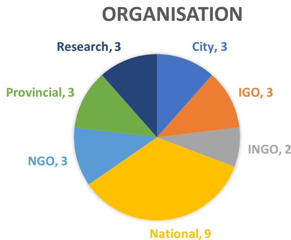
Figure 2: Jurisdictions Attending A full list attendees is included in Appendix 3.