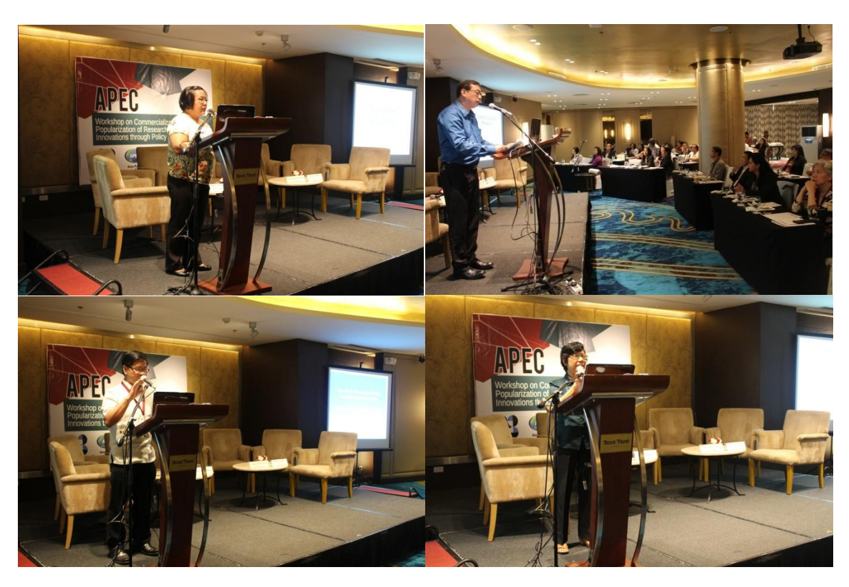
Representatives from the different case study groups presented their outputs based on the guide questions for the workshop