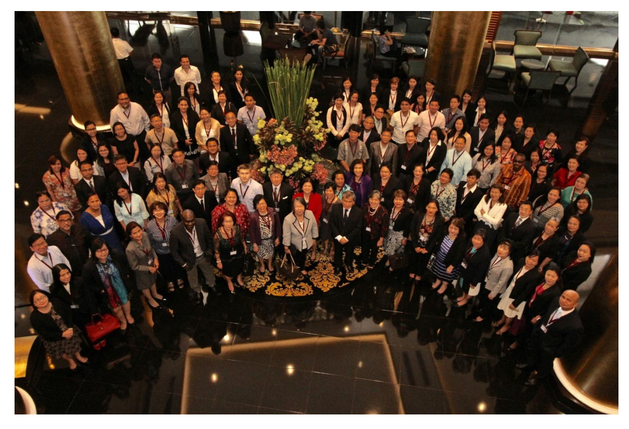
Group photo of all delegates in the APEC Workshop at the lobby of Dusit Thani Hotel