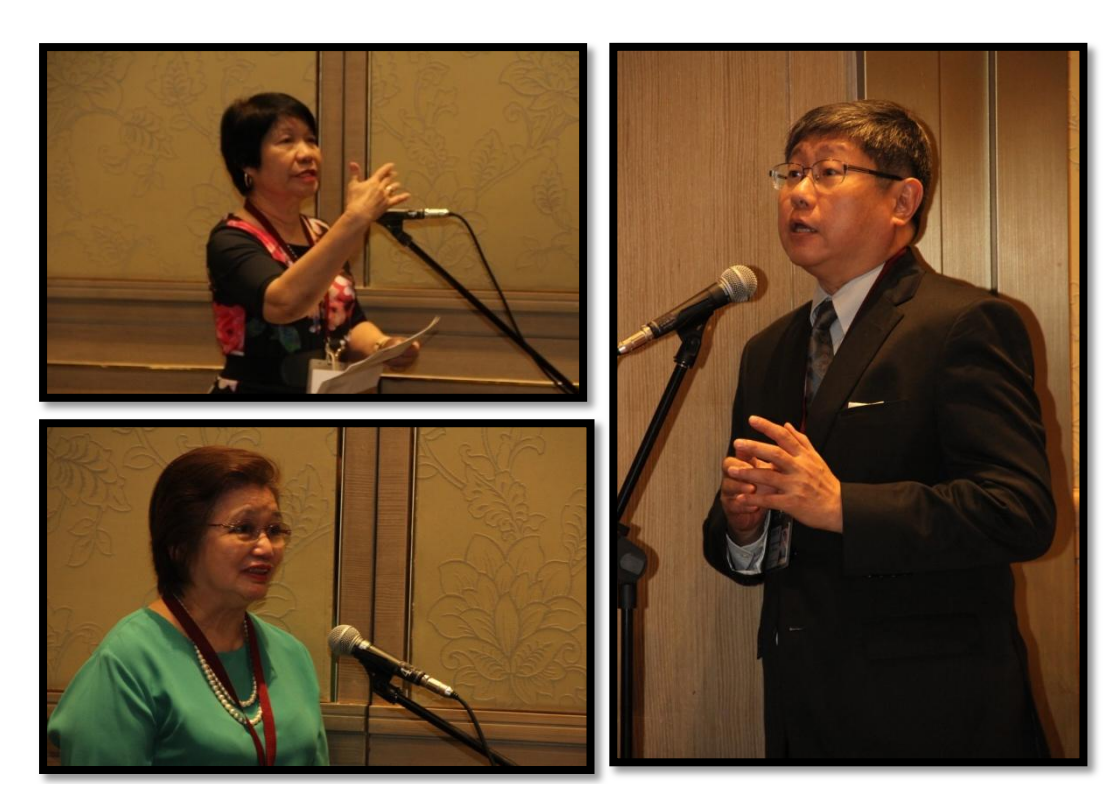
Delegates asked questions during the open forum