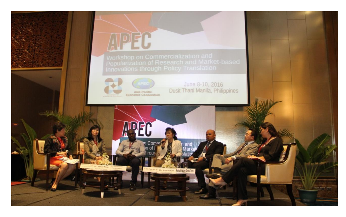
Representatives from six APEC member economies (The Philippines; Papua New Guinea; Thailand; Malaysia; The United States; and Mexico) shared respectively their experiences on the process of policy translation