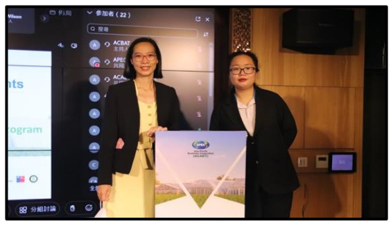
Figure 11. Team DTH from Viet Nam on the stage for their final presentation.

In Session III, Team Holeless Donut (Thailand) discussed the topic of bioenergy and bioproducts derived from sugarcane waste in Thailand. They emphasized the objective of a technological process for electricity generation from gasification and biomass production. The next was Team FIVE UKM (Malaysia) which introduced the bioelectrochemical system with marketing strategy and analysis for this project. With