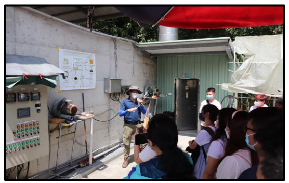
Figure 15. Technical practice in the Eco-farm.