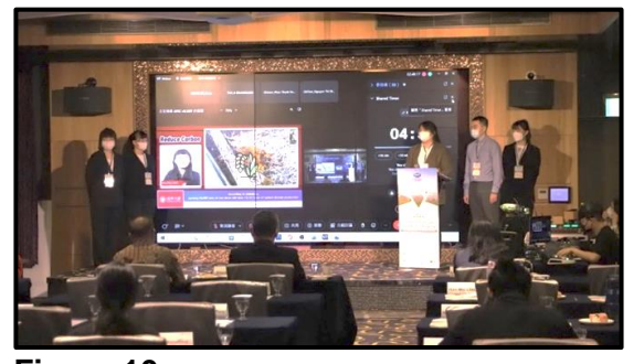
Figure 10. Team Giao Wao Deyimia from Chinese Taipei delivered their final presentation.