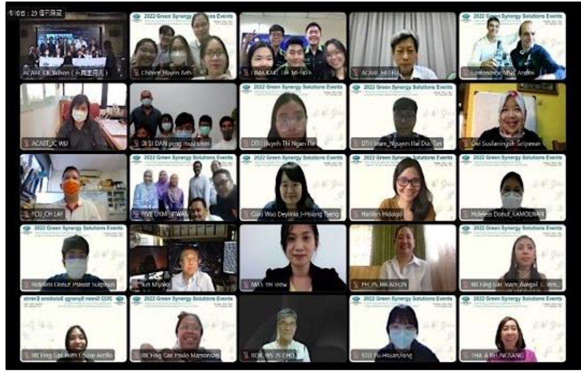
Figure 14. On-site and online participants of the young entrepreneurs training program.

As Workshop II ended, the reviewers discussed and decided on the teams' ranking. Team Biogasverse (Indonesia) won First place (Figure 12.). Team ChiTom (Viet Nam) and Team Lima Kaki (Malaysia) won Second place. Team Lomonosov_MSU (Russia), Team Giao Wao Deyimia (Chinese Taipei), and Team Holeless Donut (Thailand) won Third place. The other four teams had Honorable Mentions.