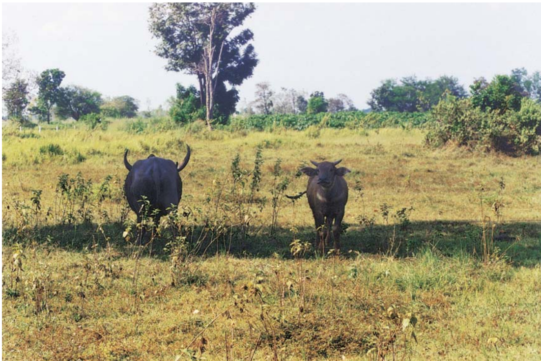
Fig. 7. Back view of old long horn female buffalo and buffalo kid