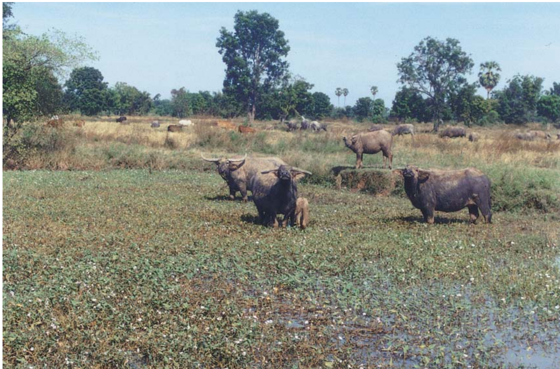
Fig. 3. Cows near swamp but buffalo in the swamp