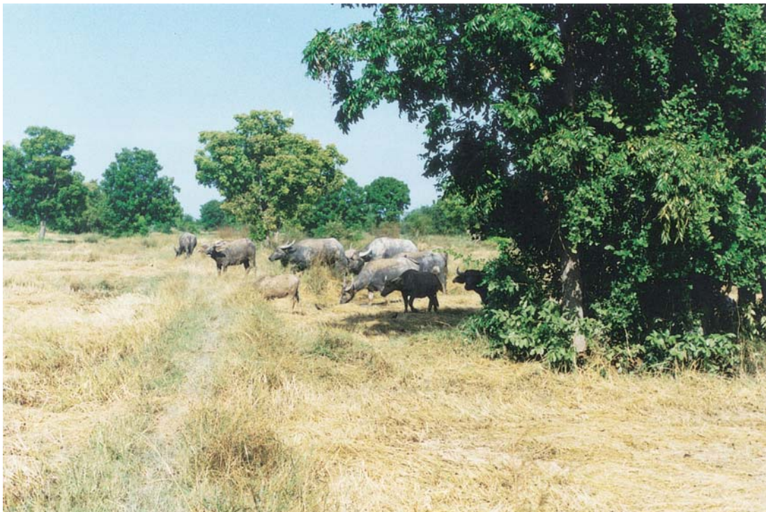
Fig. 11. The buffalo is adapted to low quality pasture as well