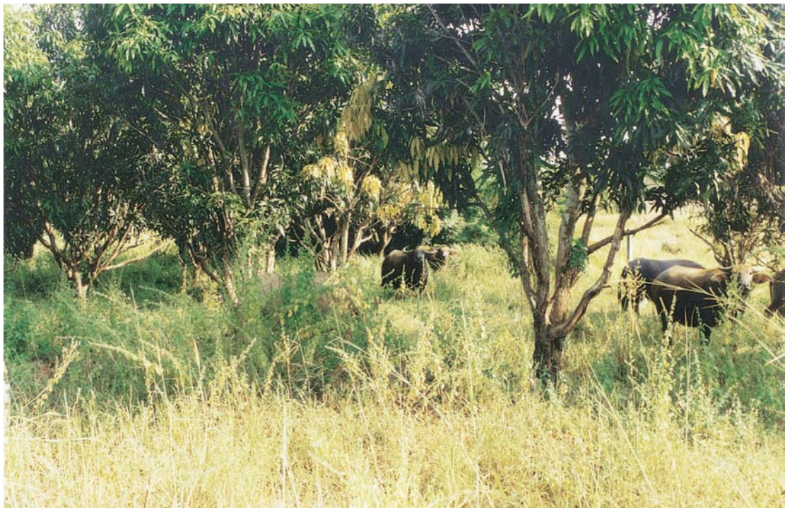
Fig. 13. A natural weed mower, buffalo, in mango garden