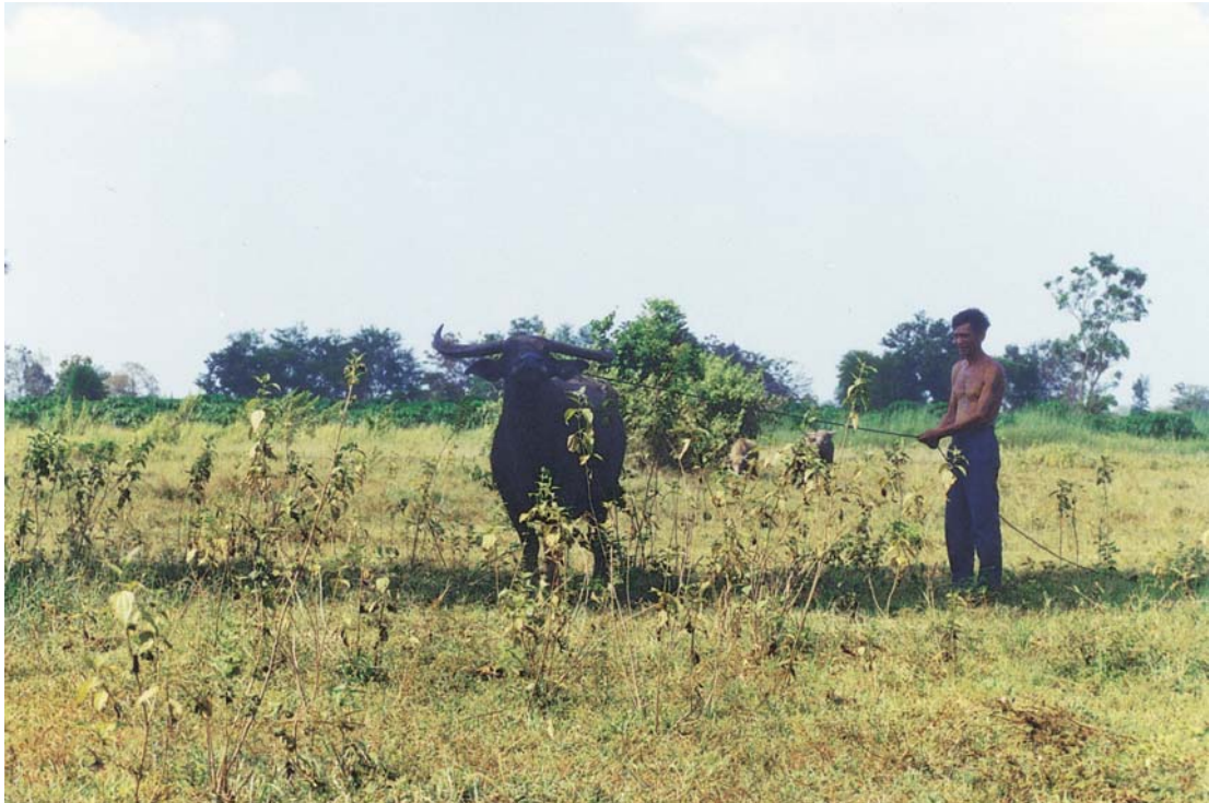
Fig. 14. Healthy and smiley buffalo owner