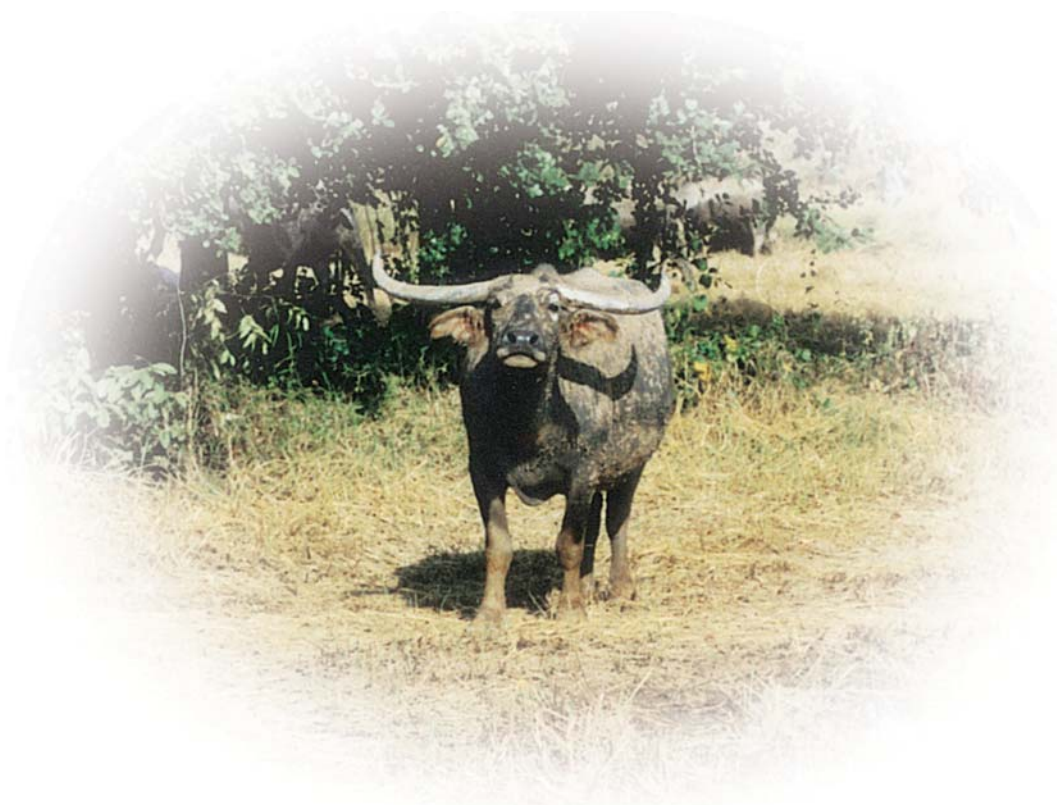
Fig. 9. Thai long horn buffalo