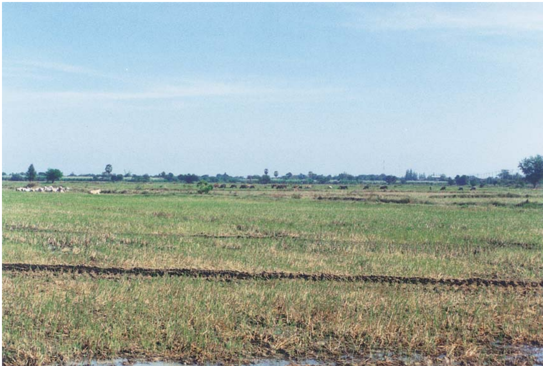
Fig. 16. Large-scale beef cattle farm in the central Thailand