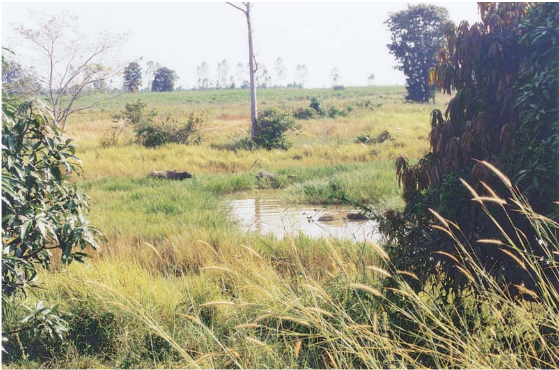
Fig. 4. Buffalo loves playing in swamp