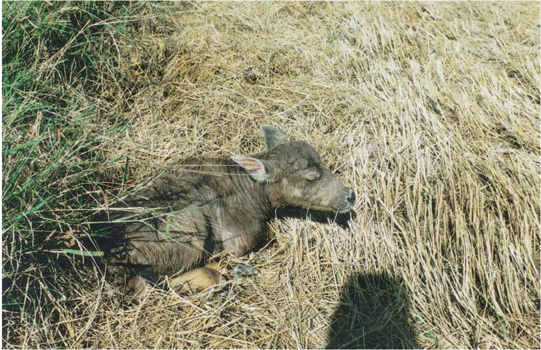
Fig. 8. A Thai buffalo kid