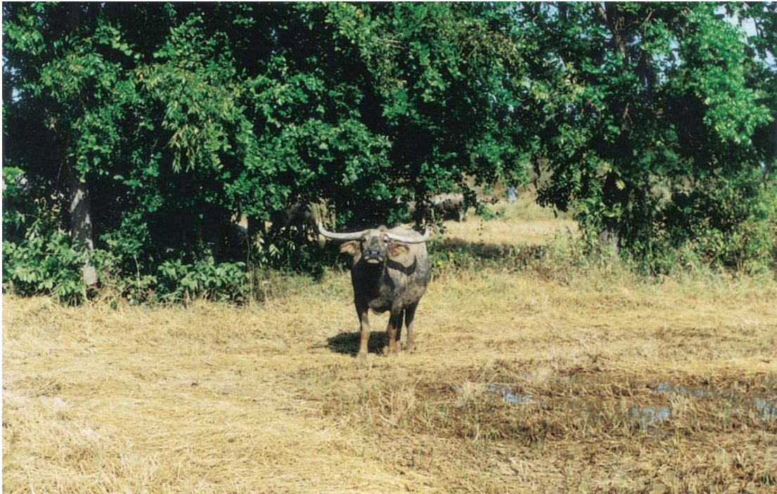
Fig. 18. Look out. Is the buffalo going to attack a colorful dressed person?