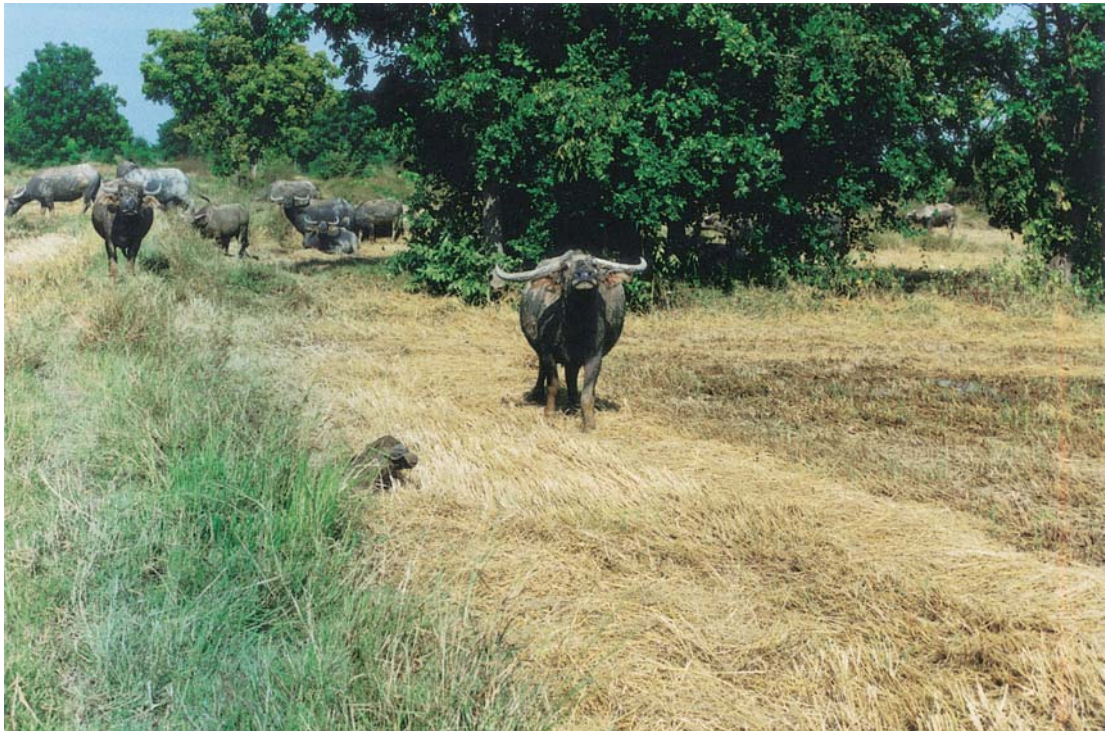
Fig. 2. Long horn and dark color buffalo