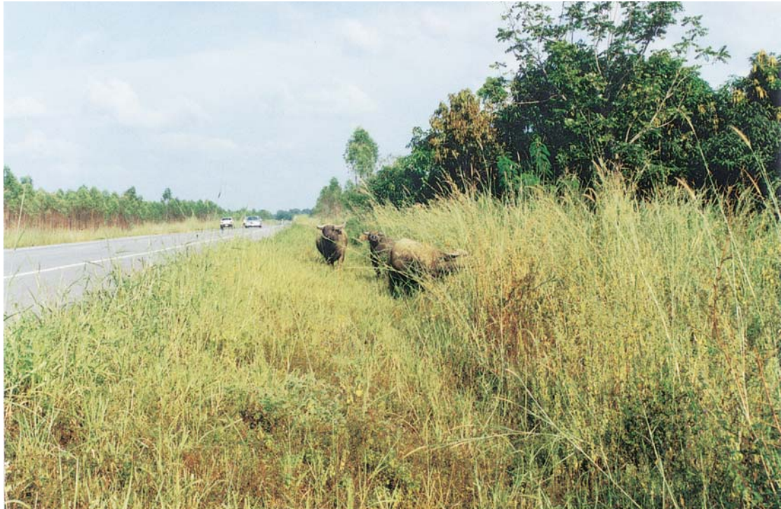
Fig. 12. Buffalo along the road near Srakaew province