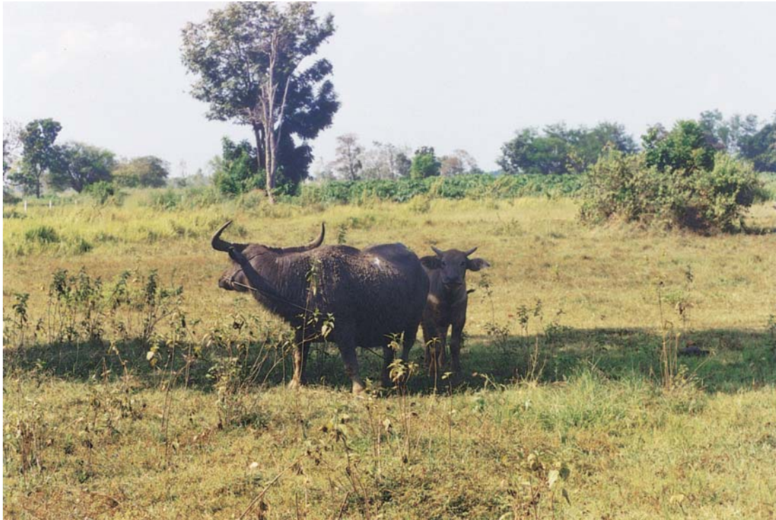
Fig. 6. A 21-year-old long horn buffalo with healthy buffalo kid