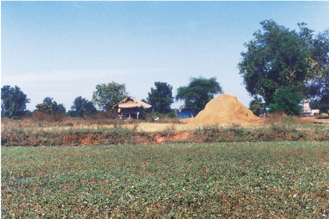
Fig. 17. Rice straw heap, low is nutrients but the buffalo can thrive on it