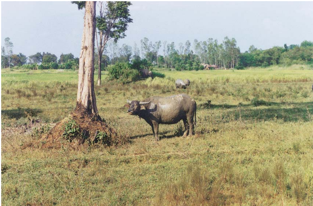
Fig. 1. Typical short horn buffalo