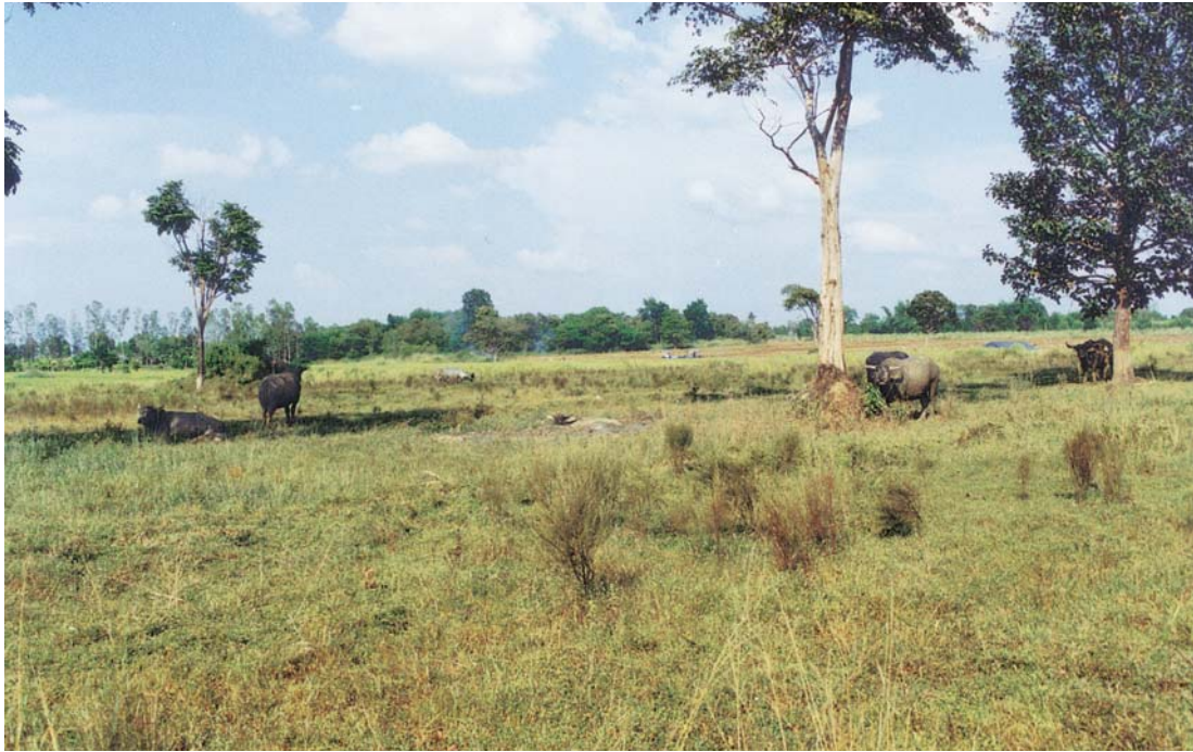
Fig. 10. Short horn buffalo resting under tree